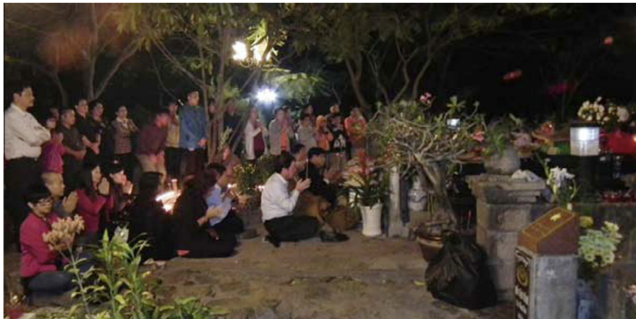
Figure 6 Vo Thi Sau's gravesite, at night.

sacrifice. This affirmative interaction can also be seen to encompass Vietnamese tourists' broader engagement with the archipelago's natural heritage, their very access to this and ability to appreciate it being a direct result of successful nationalist struggles that re-unified the nation and allowed Con Dao to be opened up as a destination in which all Vietnamese can explore the nation's past struggles, as exemplified in Con Son's history and its natural beauty.