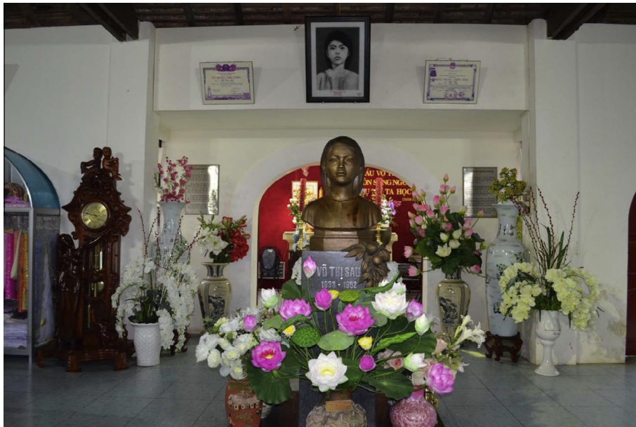
Figure 5 The interior of Vo Thi Sau's memorial building (photograph by author 2, 2013).