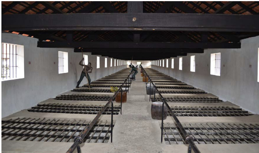
Figure 2 So called 'tiger-cage' cells in Phu Son prison, with figures representing guards.