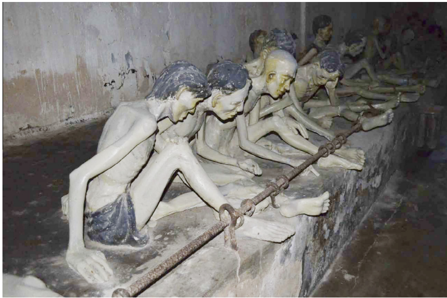
Figure 3 Life-size figures of prisoners in Phu Son prison (photograph by author 1, 2013).