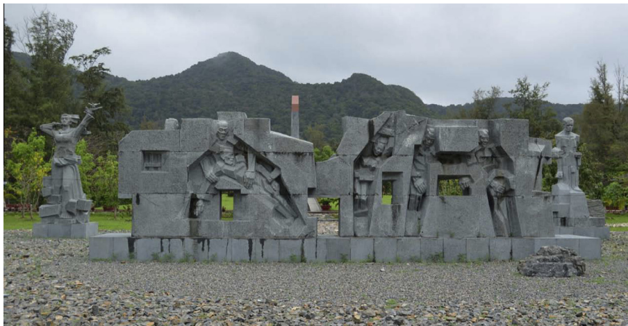
Figure 4 Sculptures in Hang Duong cemetery entrance area.

The spatial alignment here is striking. One of the island's plush hotels is directly adjacent to one of the island's darkest sites and directly overlooks the archipelago's marine environment. This juxtaposition is a vivid symbol of the manner in which Con Son's tourism has been able to combine (various shades of) thanatourism with engagement with the island's natural beauty in a relatively stable package that embraces both elements. Indeed, Hang Duong cemetery embodies these aspects in a single site. The sheer scale of the cemetery and its major memorial structures indicate the mass of Vietnamese prisoners killed and interred there. This, and the Vietnamese visitors' manifestly profound respect for and acts of tribute to the dead would suggest that the site is one of particularly dark thanatourism (in terms of Miles's previously discussed characterisation). Yet the visitors' and local population's uses of the site are far less sombre than such a characterisation